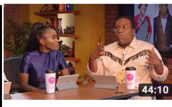
The ABS Show - Epi 1 - Bobrisky, teckno, Rotimi,